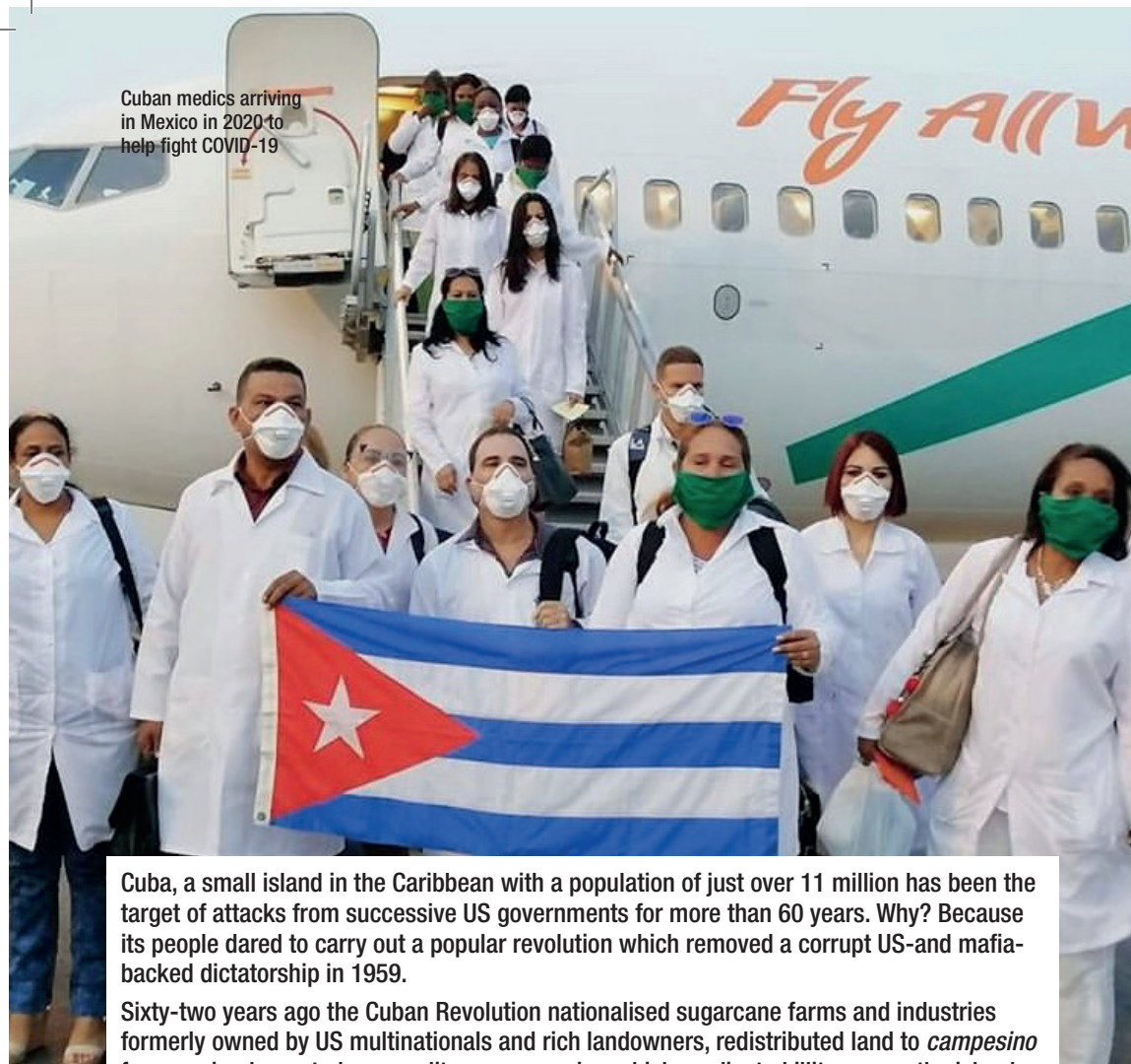
Cuban medics arriving in Mexico in 2020 to help fight COVID-19

Cuba, a small island in the Caribbean with a population of just over 11 million has been the target of attacks from successive US governments for more than 60 years. Why? Because its people dared to carry out a popular revolution which removed a corrupt US-and mafia-backed dictatorship in 1959.